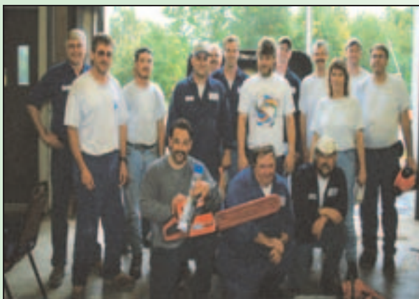
Ledyard, CT Public Works. Great Group!