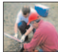
Right at home!