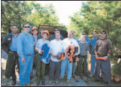
Cape Cod area training class.