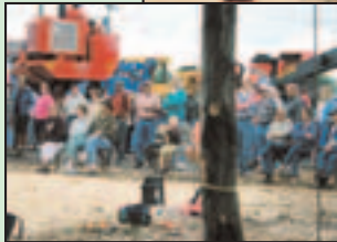
Boonville, NY Woodsmen's Day's Demo crowds at the CJ Logging/Husqvarna area.