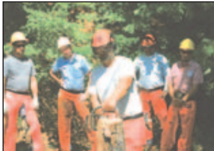
GA LTAP two-day hand's on saw program. Cartersville, GA