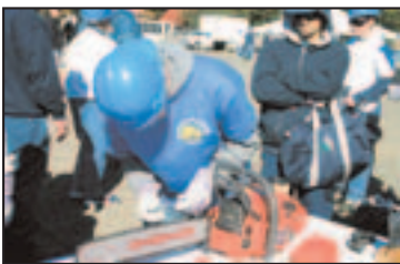
Connecticut Student Career Day