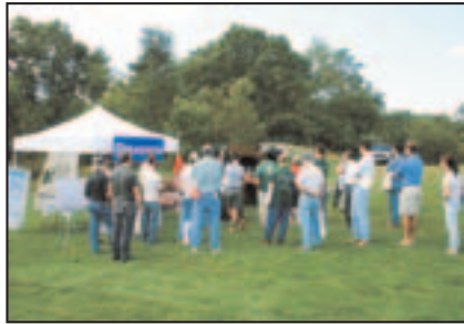
Rhode Island Construction Safety Day...