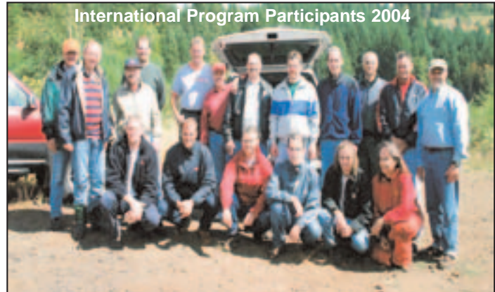
International Program Participants 2004